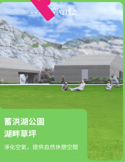
蓄洪湖公園 湖畔草坪 淨化空氣，提供自然休憩空間