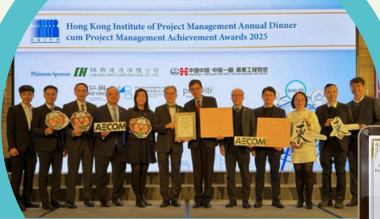
「項目管理成就大獎 2025」建築/工程範疇獎項 Hong Kong Institute of Project Management