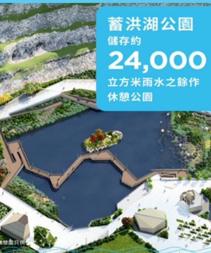
蓄洪湖公園 儲存約 24,000 立方米雨水之餘作 休憩公園